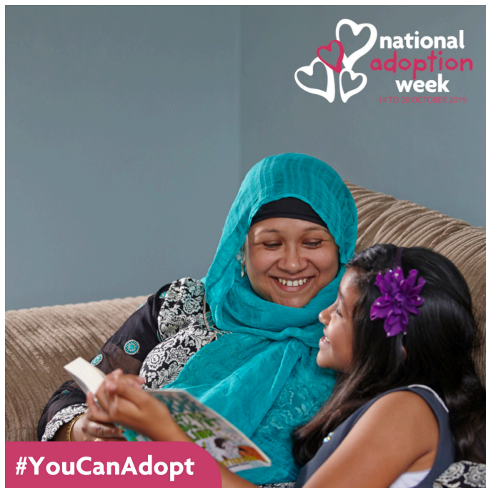
Image download link: https://www.first4adoption.org.uk/library/selection-youcanadopt-social-media-posts-naw/

This National Adoption Week we're looking for homes for those children that wait the longest. [LINK] #YouCanAdopt