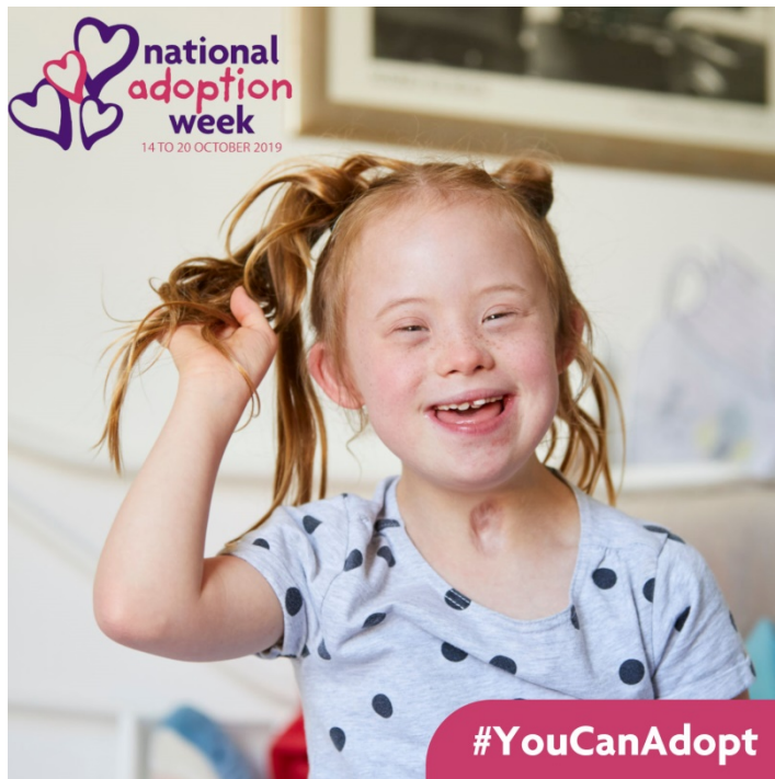
Image download link: https://www.first4adoption.org.uk/library/selection-youcanadopt-social-media-posts-naw/

Children with disabilities or complex health issues are among those who wait the longest to be adopted. Could you provide a loving home? Find out more [LINK] #YouCanAdopt