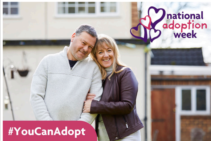
Image download link: https://www.first4adoption.org.uk/library/selection-youcanadopt-social-media-posts-naw/

It takes a special kind of person to adopt. Could that person be you? [LINK] #YouCanAdopt