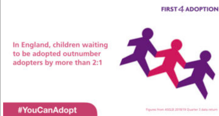
Image download link: https://www.first4adoption.org.uk/library/national-regional-adoption-statistics-social-media-posts-naw/

It's National Adoption Week but we're here all year round. Get in touch & see if adoption is right for you [LINK] #SupportAdoption