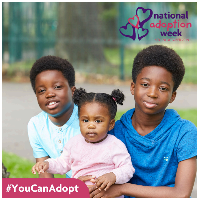
Image download link: https://www.first4adoption.org.uk/library/selection-youcanadopt-social-media-posts-naw/

Find out more here [LINK TO AGENCY] #YouCanAdopt